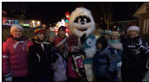
1st Labrador West Girl Guides hanging out with Labrador City's town mascot "CHILL" at the Santa Parade. (left)

1st Labrador West Sparks, Brownies, and their guiders taking a ride on our float in the freezing cold -20 BRRRRRRR... This is our Guiding Family. We won best float for an organization. (right)