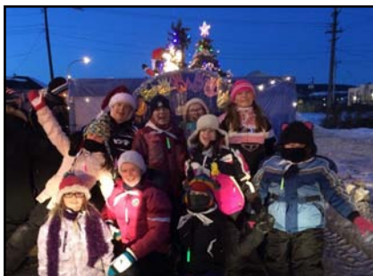
1st Lab. West guides and 1 lonely pathfinder at the 2014 Santa parade.