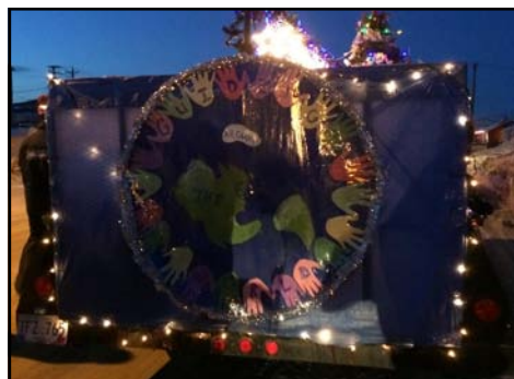
The back of the float.